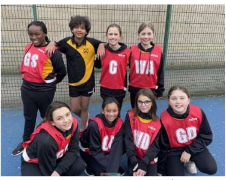
Year 9 Netball Tournament where the girls came 3<sup>rd</sup> out of 10