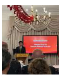
Programme which is incredibly special indeed.

I also visited the Chinese Embassy this week for the Mandarin Excellence Programme Headteachers' Conference where I got to hear about the exciting plans and opportunities to develop the programme further. Out of the 3,458 secondary schools in England, only 80 are part of the Mandarin Excellence