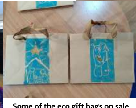
Some of the eco gift bags on sale