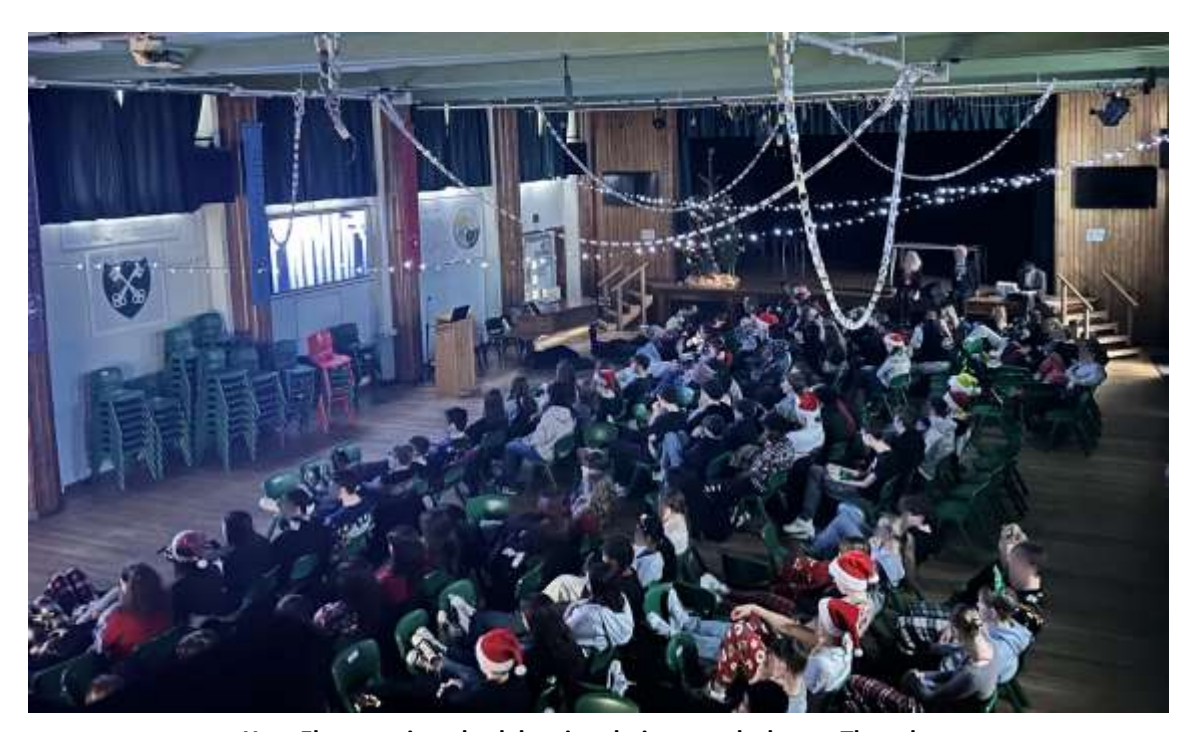
Year Eleven enjoyed celebrating their rewards day on Thursday

<u>Stop It Now</u>: Stop It Now is run by the Lucy Faithfull Foundation. Adults can call if they are worried about an adult, child or young person's sexual behaviour. They can call 0808 1000 900 or use their live chat function.